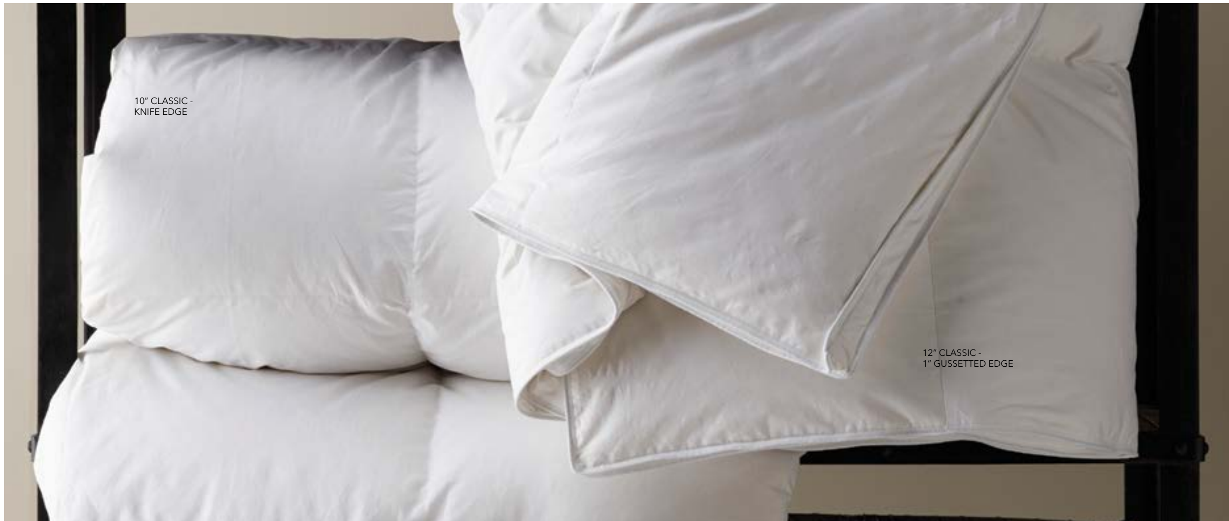
10" CLASSIC - KNIFE EDGE